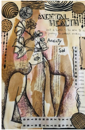
Lia Rashidian Y10—Mental Health inspired